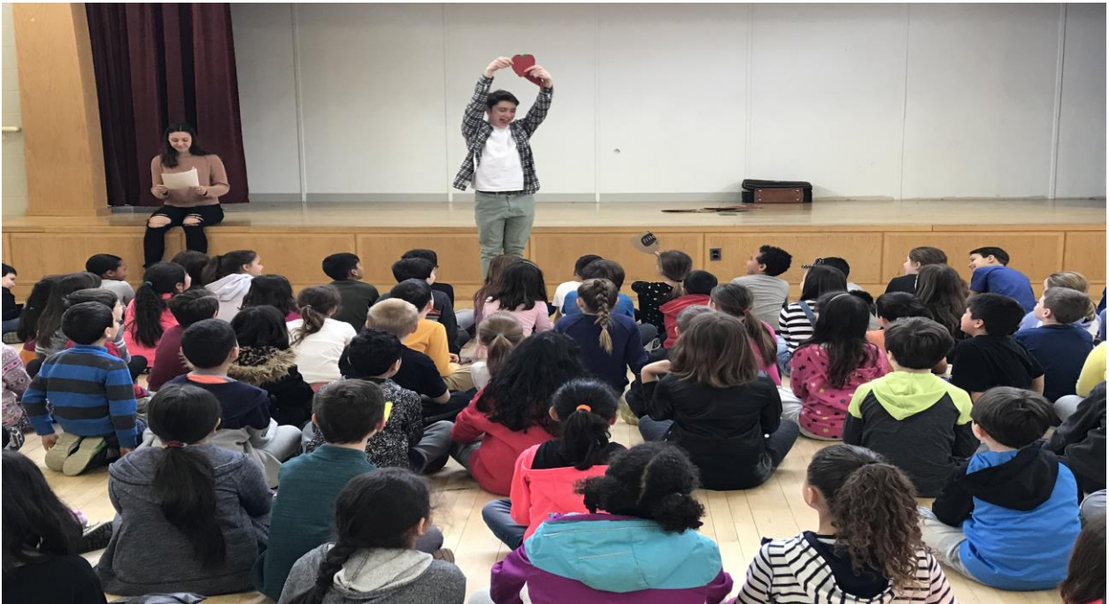
WHS Drama students perform several Eric Carle book skits that remind us of important SMART choices.